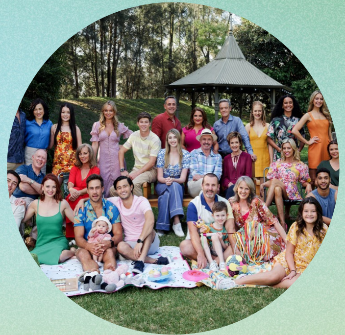
Communities that are second families