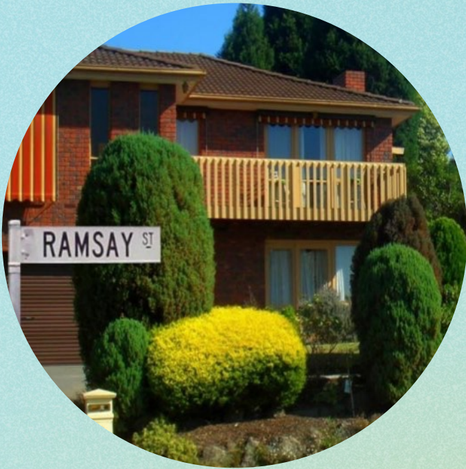
A vibrant suburban life