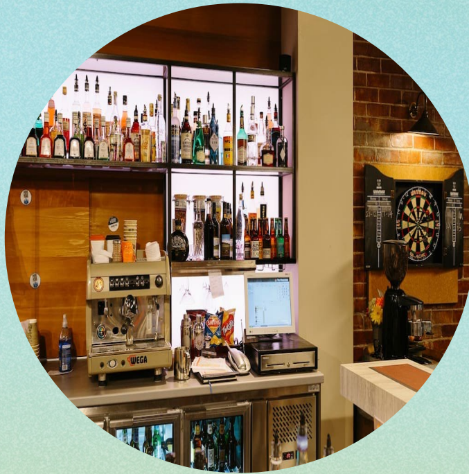
Venues that are lively and optimistic